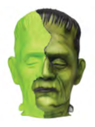
Link: http://3dplatform.com/ wp-content/uploads/2015/09/3DPrint_ Frankenstein1.png