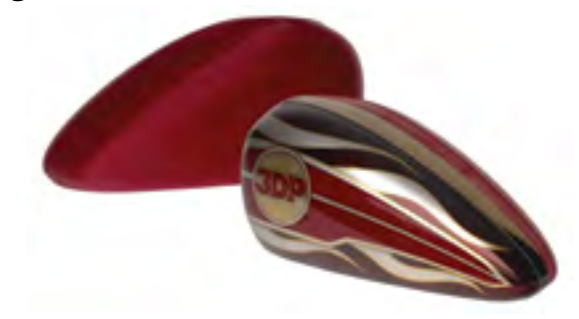
{\bf Link:} \ \underline{http://3dplatform.com/wp-content/uploads/2015/09/3DPrint\_GasTank1.png}