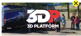
Do not place logo on busy backgrounds